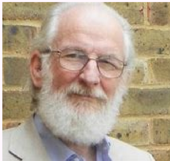
Professor David Crystal

Last summer we acquired a new unit in Eldon Garden which we are calling The Crystal Room in his honour.